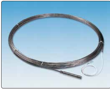
● Model 4500HT shown with Teflon ® cable inside stainless steel tubing (coiled, pre-installed configuration).

are possible and the frequency output signal is not affected by changing cable resistances (caused by splicing, changes of length, terminal contact resistances, etc.), nor by penetration of moisture into the electronic circuitry. A secondary vibrating wire temperature sensor (or thermistor), located in the same housing, permits the measurement of temperatures at the piezometer location.