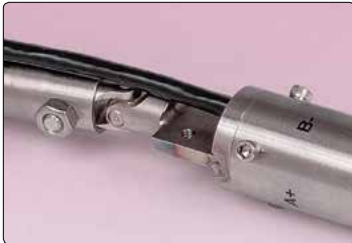
● Closeup of Model 6150D sensor, stainless steel tubing and universal joint.

Readout is accomplished using the Micro-1000 or Micro-800 Datalogger via a modem interface (each modem is capable of supporting up to 6 IPI sensor strings). The maximum number of sensors that can be used in this configuration is 32. Digital systems offer greater noise immunity than analog types, and are capable of signal transmission over cables up to 305 m in length.