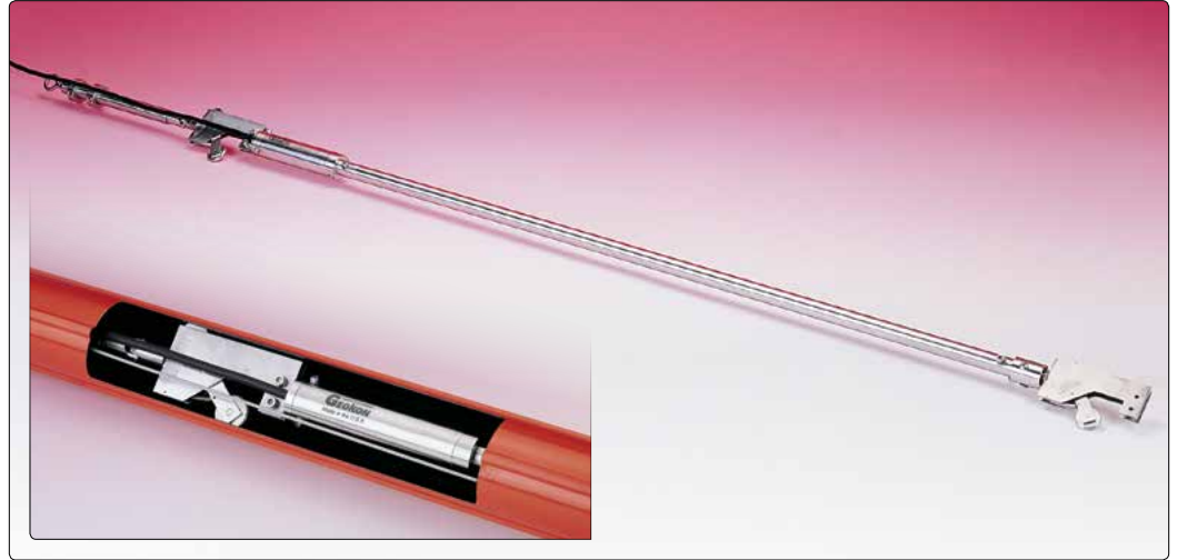
• Model 6150 MEMS In-Place Inclinometer. Inset photo reveals installation detail with section of Model 6400 Inclinometer Casing removed.