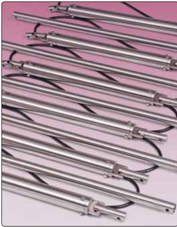
● Model 6150D Digital Sensor, Wheelless, Addressable, MEMS In-Place Inclinometer.