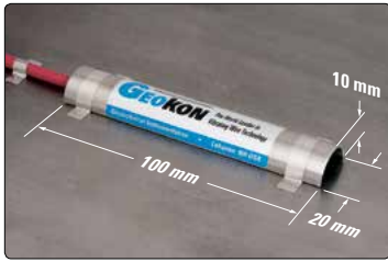
● Model 4150 under the Model 4150-1 protective cover plate, with dimensions.