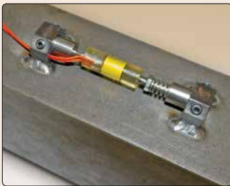
● Model 4150 shown with optional arc-weldable mounting blocks.