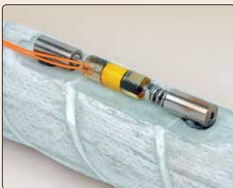
● Model 4151 Strain Gage mounted to a fiberglass rebar.