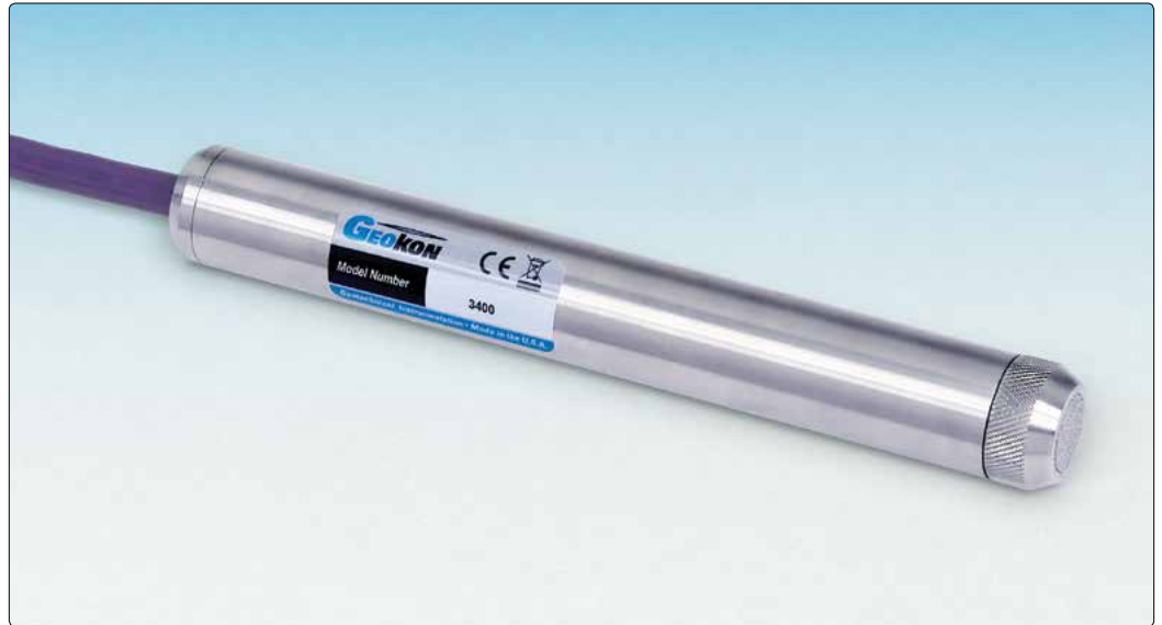
• Model 3400 Semiconductor Piezometer.