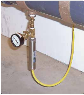
• Model 3400 and Dial Gage Pressure Transducer on a tee fitting.